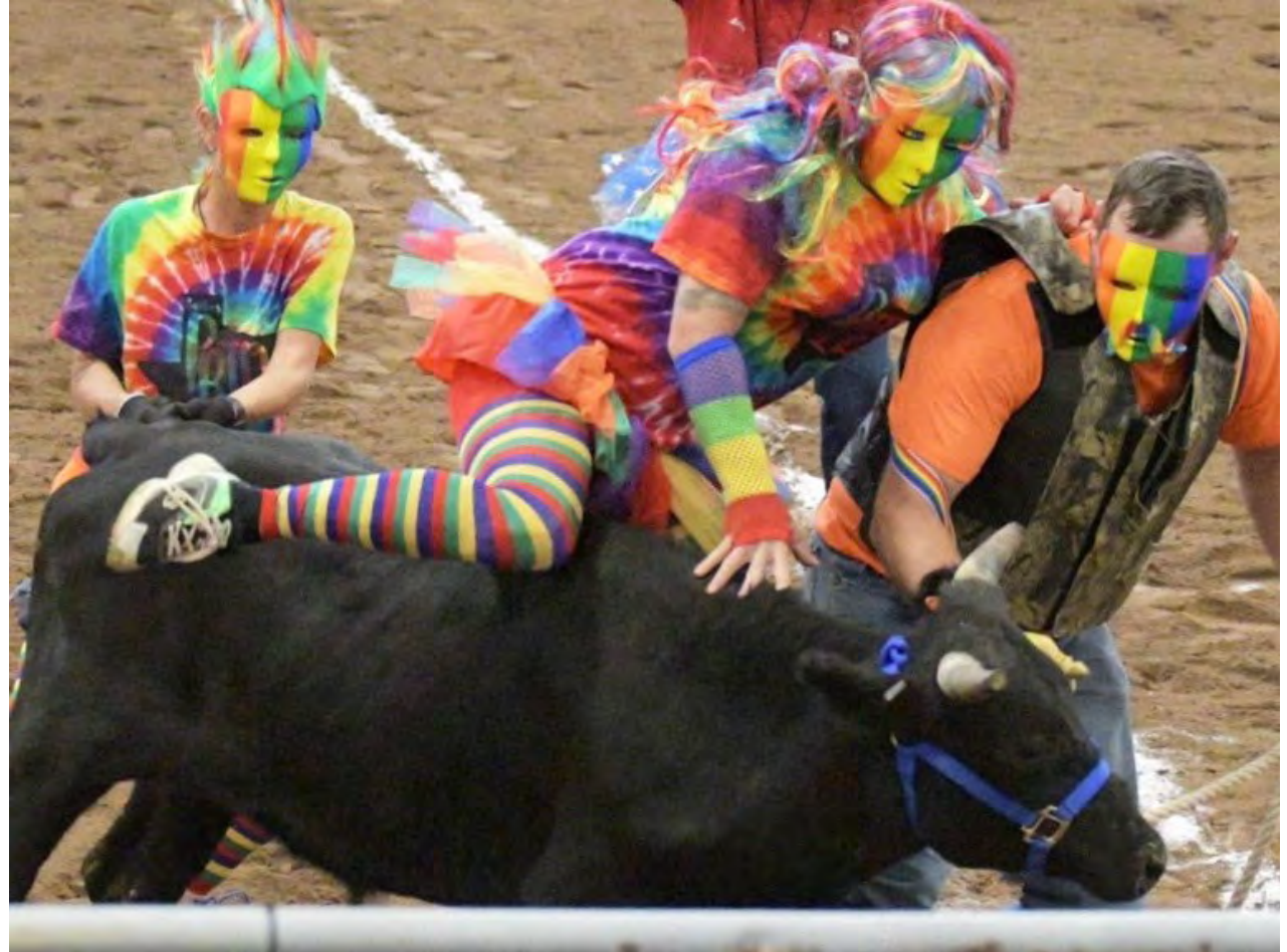
Wild Drag Race

Sponsor packages can also be tailored to specifically meet your needs.