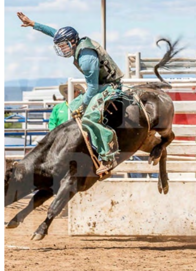
Men’s Bull Riding