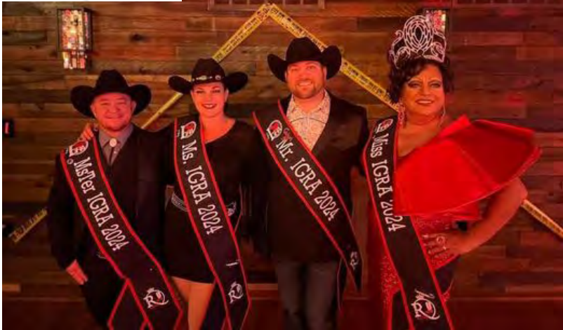
2024 IGRA Royalty