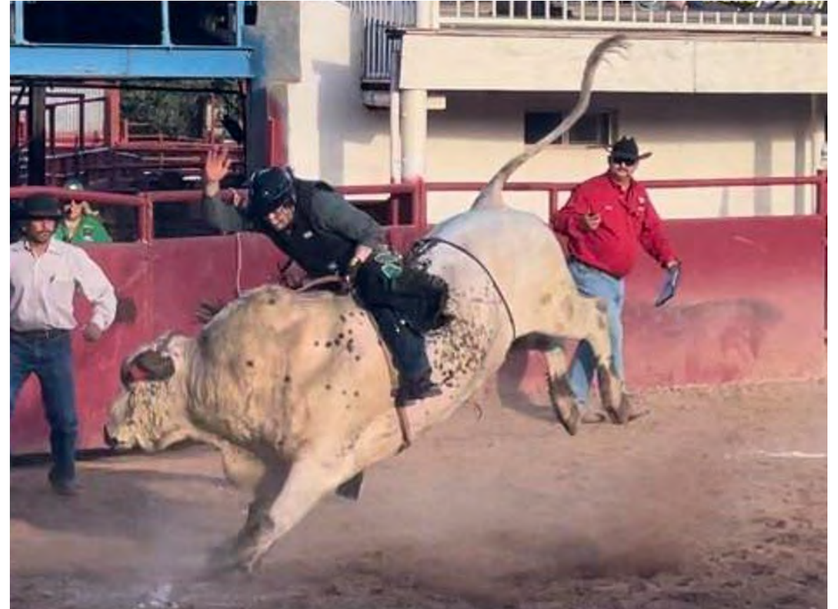
Women’s Bull Riding