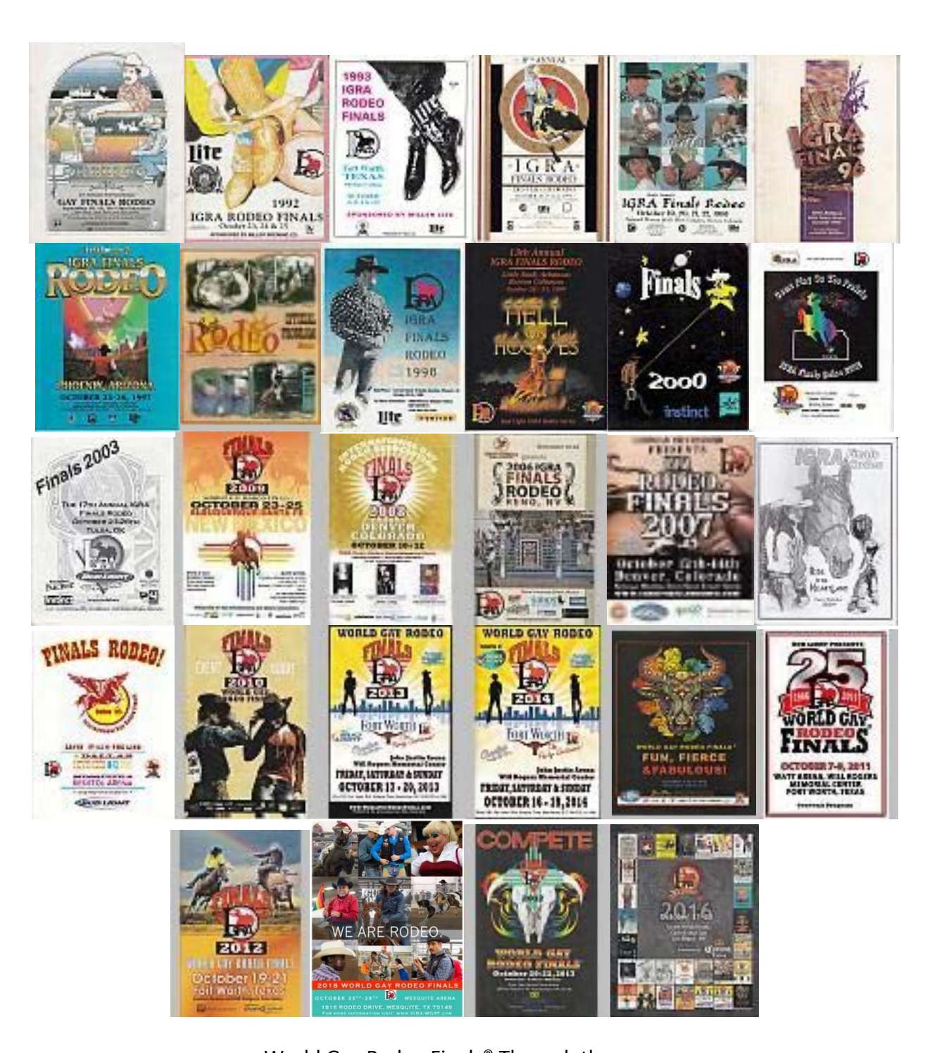
World Gay Rodeo Finals® Through the years